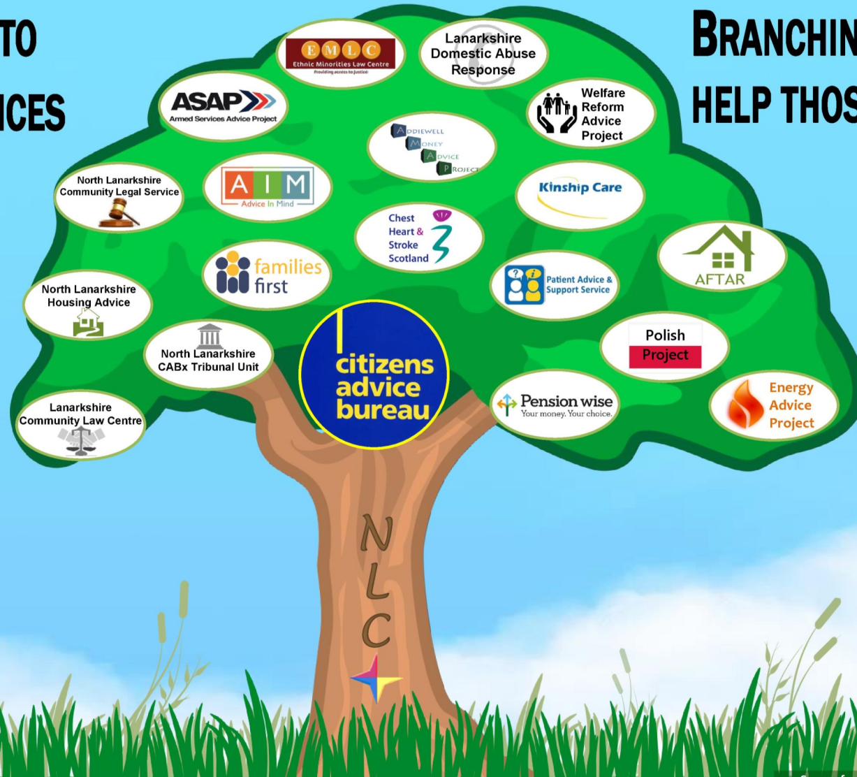
Some of our Partners